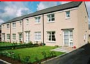
A selection of Langstane Properties

circumstances enables them to do so, providing they have been in the property for one year.