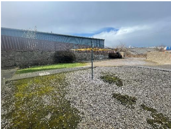
Washing line and rear property parking