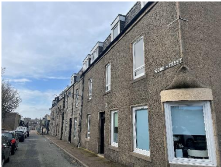
Wood Street - Exterior