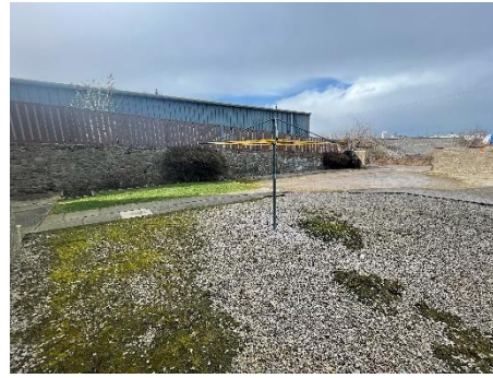
Washing line and rear property parking