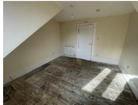
Living / Bedroom area