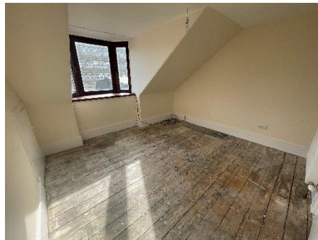
Living / Bedroom area