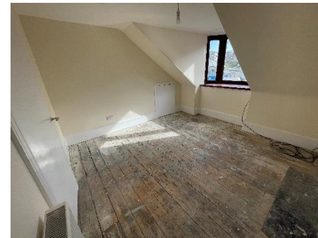
Living / Bedroom area