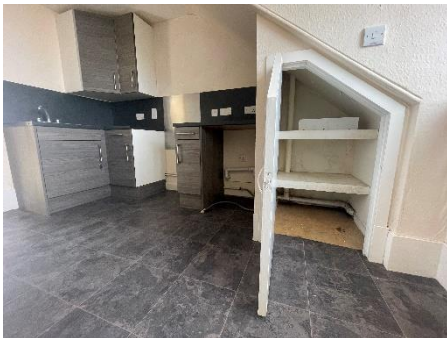
Kitchen and Storage space